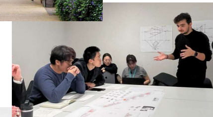
Jury @ AA School