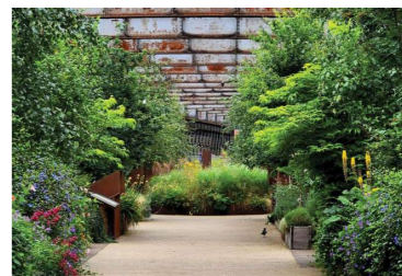
National Trust: Castlefield Viaduct