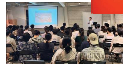
Lecture @ NCKU Tainan, Taipei