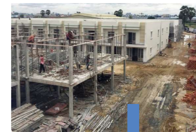
Housing development in Cambodia